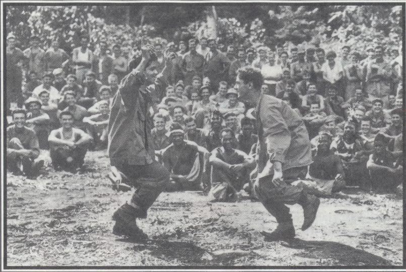
Inspired by the dancing of the local tribesmen in Talasea, New Britain, a couple of Marines trot out their best crowd-pleasing jitterbug.

The composers, authors and music publishers,